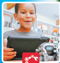
Robotics & Coding