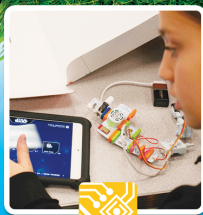
Circuitry & Electronics