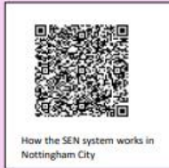
How the SEN system works in Nottingham City

How the SEN system works in Nottingham City Thursday 6 th July 10 – 11.30am on Microsoft Teams Scan the QR code to join or click the link How the SEN system works in Nottingham City