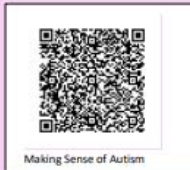
Making Sense of Autism

AET Making Sense of Autism Wednesday 7 th June 6.30 – 8pm on Microsoft Teams Scan the QR code to join or click the link Making Sense of Autism for Parents