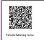
Parents' Meeting online

Tuesday 29 th June 1 – 2.30pm Location TBC Thursday 13 th July 6.30 – 8pm on Microsoft Teams Scan the QR code to join or click the link Parent's coffee meeting online