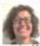
Learning Mentor (Mon, Tues, Wed)