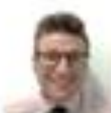
Deputy Head Pastoral Support