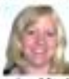
Learning Mentor (Mon, Thurs, Fri)