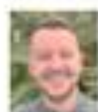
Deputy Head Teaching & Learning