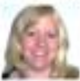
Learning Mentor (Mon, Thurs, Fri)