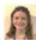
Deputy Head Inclusion