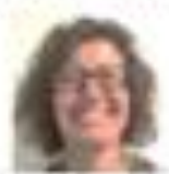
Learning Mentor (Mon, Tues, Wed)