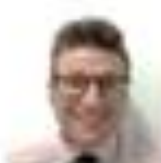
Deputy Head Pastoral Support