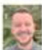
Deputy Head Teaching & Learning