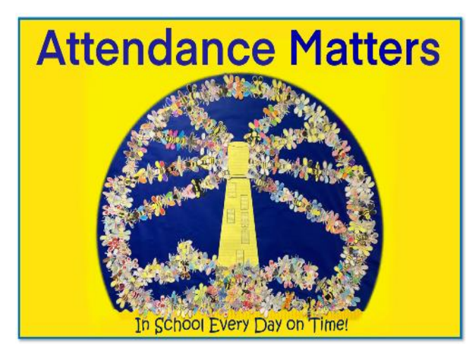
Holidays in Term Time Will Not Be Authorised